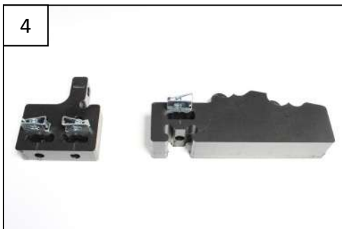
4 Position the clamped bolts as shown (4) and push them to the bottom (5)