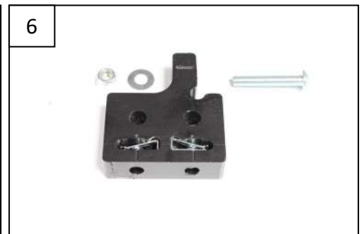
6 Prepare step (7) with Tbhc 8x50mm + 2 M8 Washers + 1 Em8f