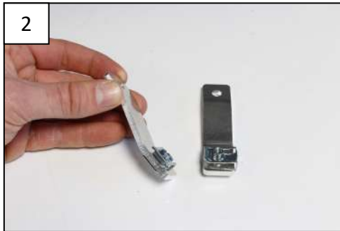
2 Place the clamped bolts as shown (2) and fix it on the bike on left and right sides using the OEM screws + M6 Washers + Em6f (3)